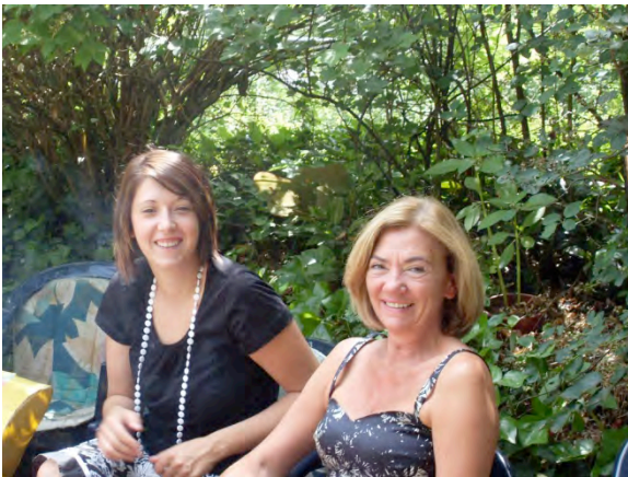
The ladies from the Ronald McDonald house